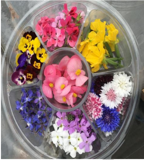
Mixed Flower Wheel